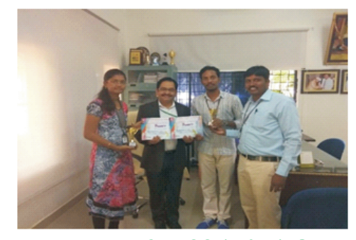
Runners Up in CHESS (M&W) @ VJIT