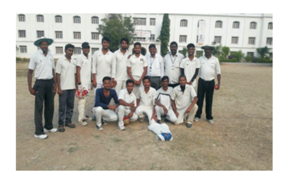
Cricket Runners up at Global Engg. College