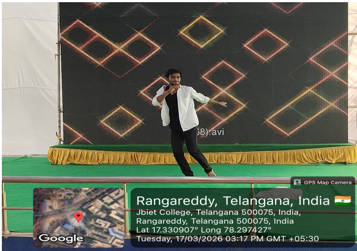
Fig. 3: Solo dance performances showcasing modern styles.