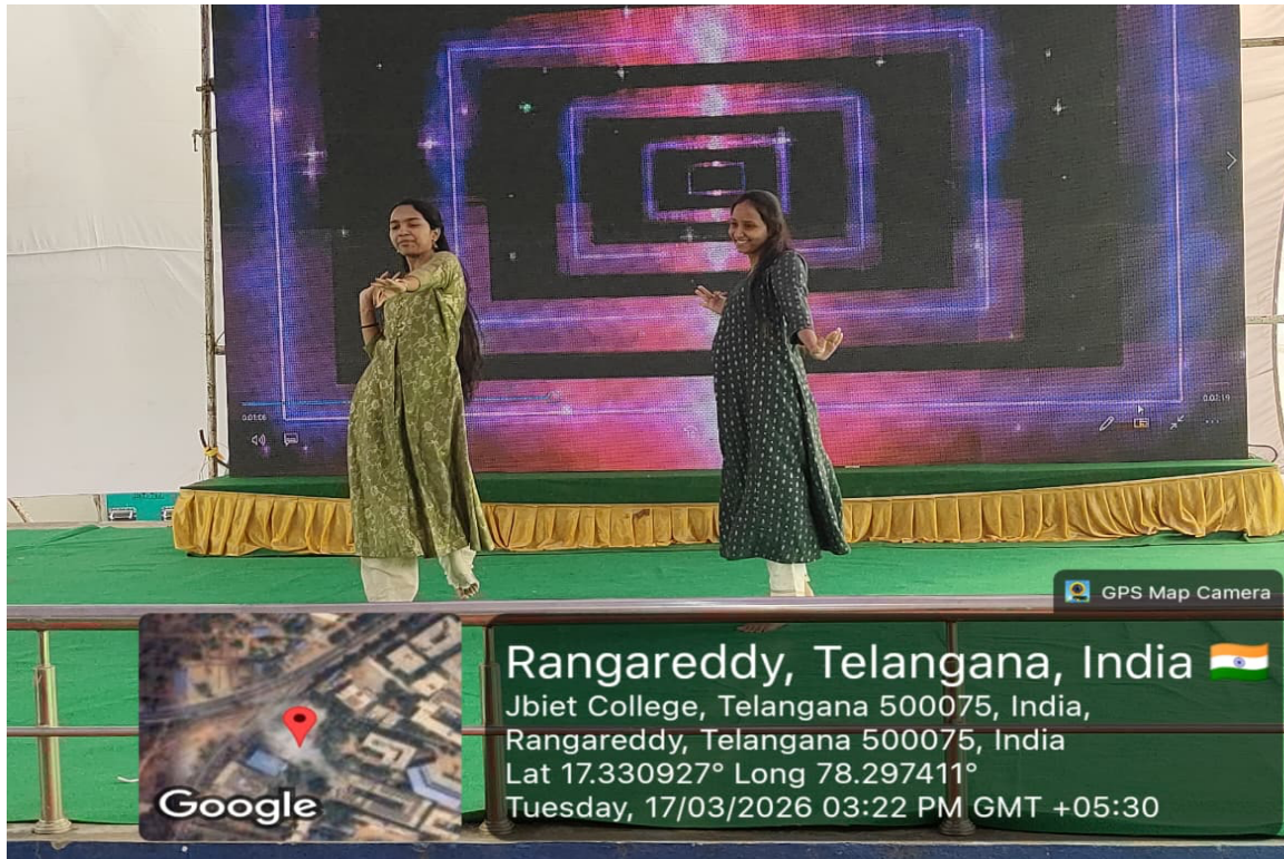
Fig. 2: Group dance performances showcasing modern styles.