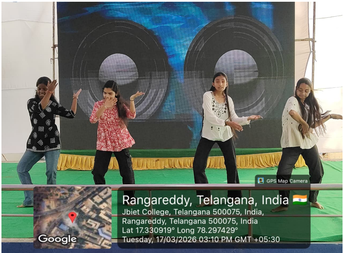
Fig. 5: Group dance performances showcasing modern styles.