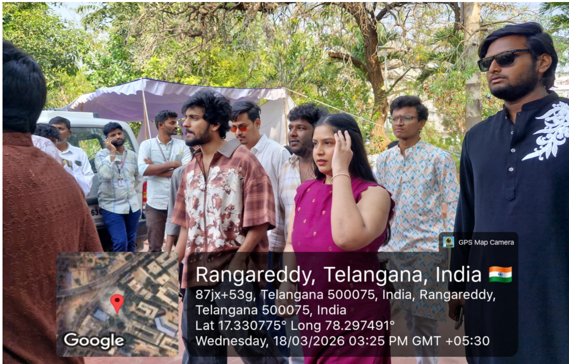
Fig. 10: Students in vibrant traditional attire during Traditional Day 2K26, showcasing cultural diversity and festive spirit.