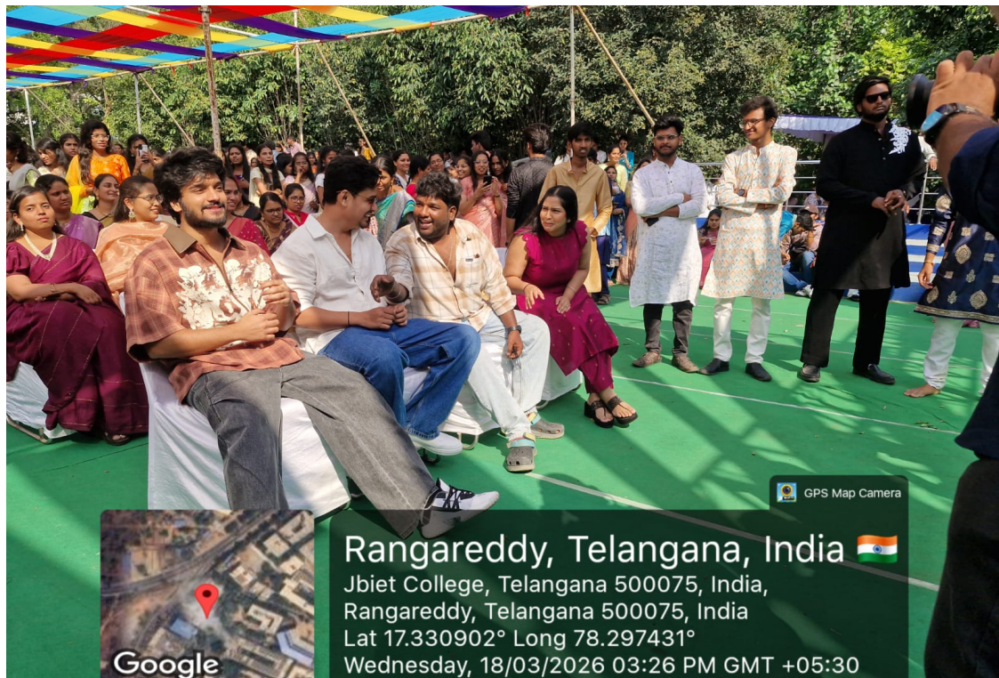
Fig. 11: DJ session and closing celebration marking the joyful conclusion of Traditional Day 2K26.