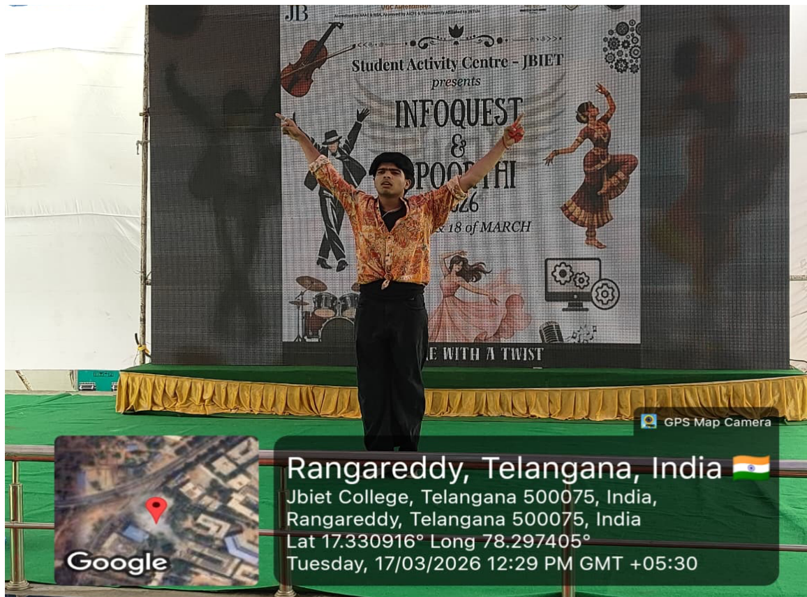
Fig. 1: Stand-up comedy session entertaining the audience with humor and creativity.

We also extend our thanks to all participating students and nearby colleges for their enthusiastic involvement, which contributed significantly to the success of the fest.