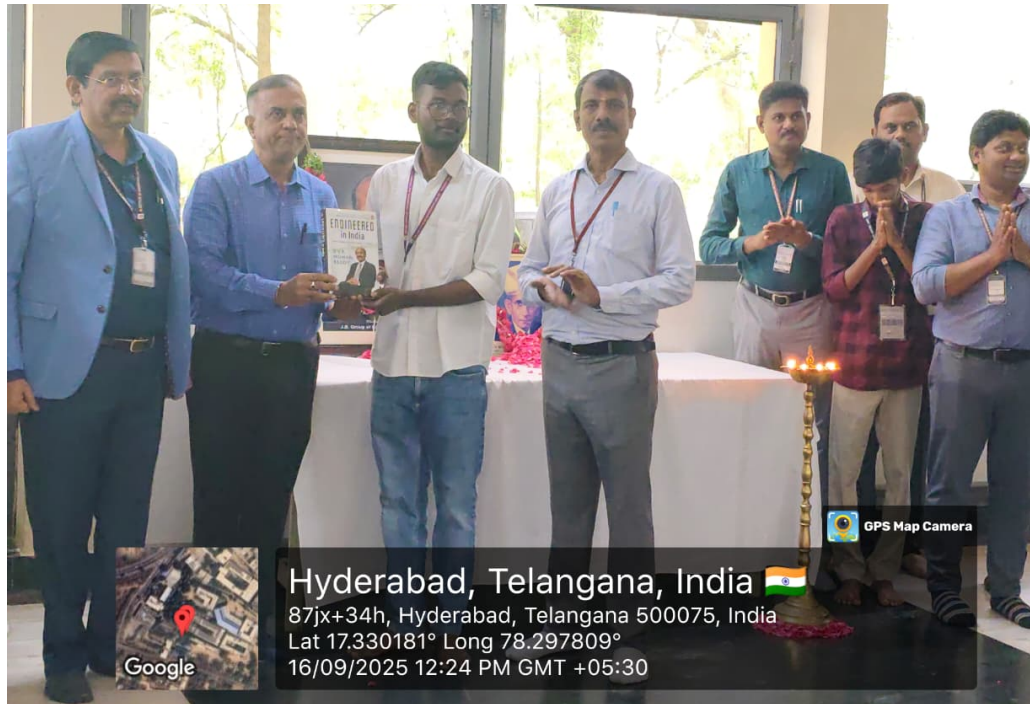
Fig. 7: Prize awarded in the Quiz Competition, encouraging continued excellence in learning.