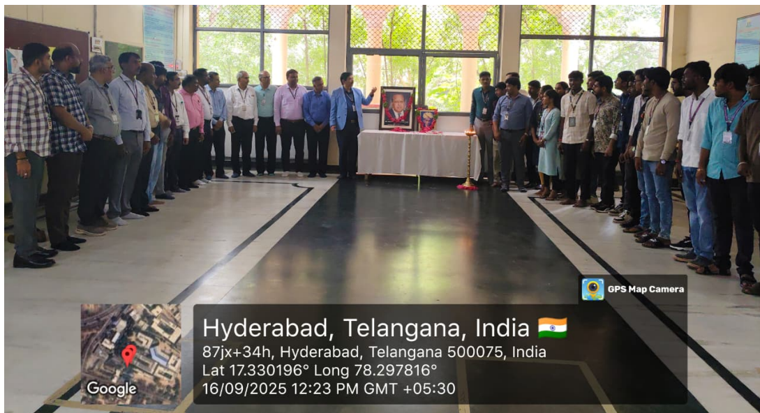
Fig. 8: Group photograph of the dignitaries and participants on Engineers' Day, capturing the celebratory spirit of the event.