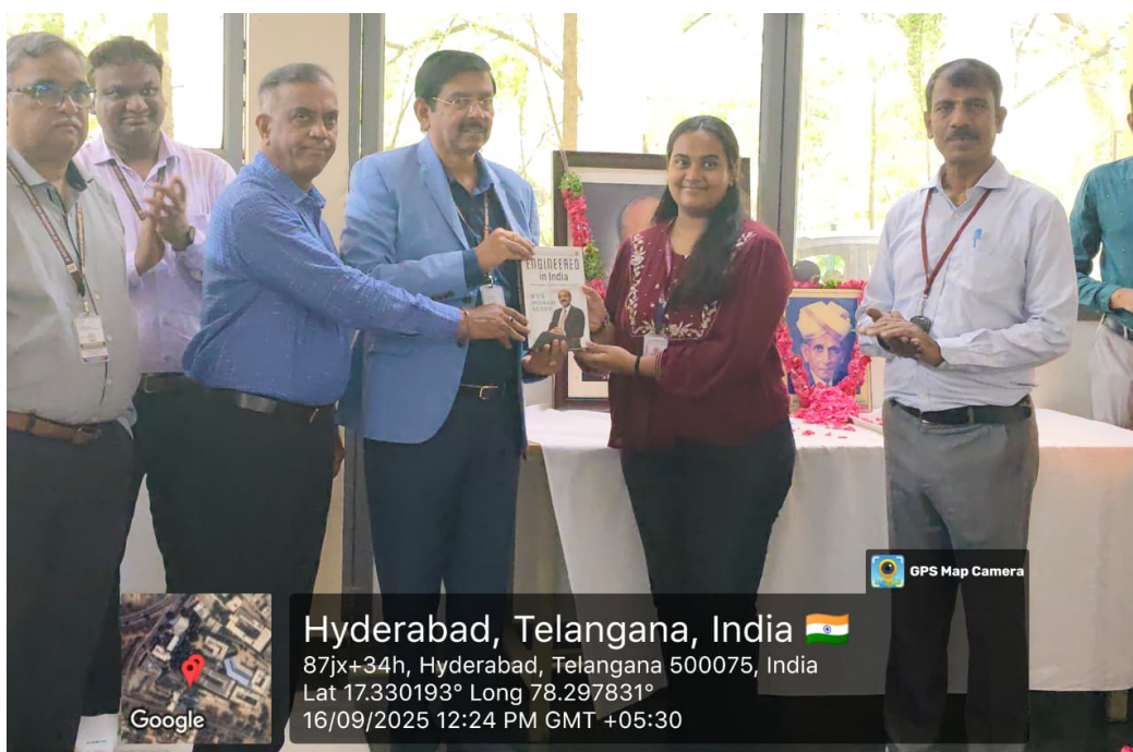
Fig. 6: Prize awarded in the Quiz Competition, recognizing outstanding intellectual engagement.