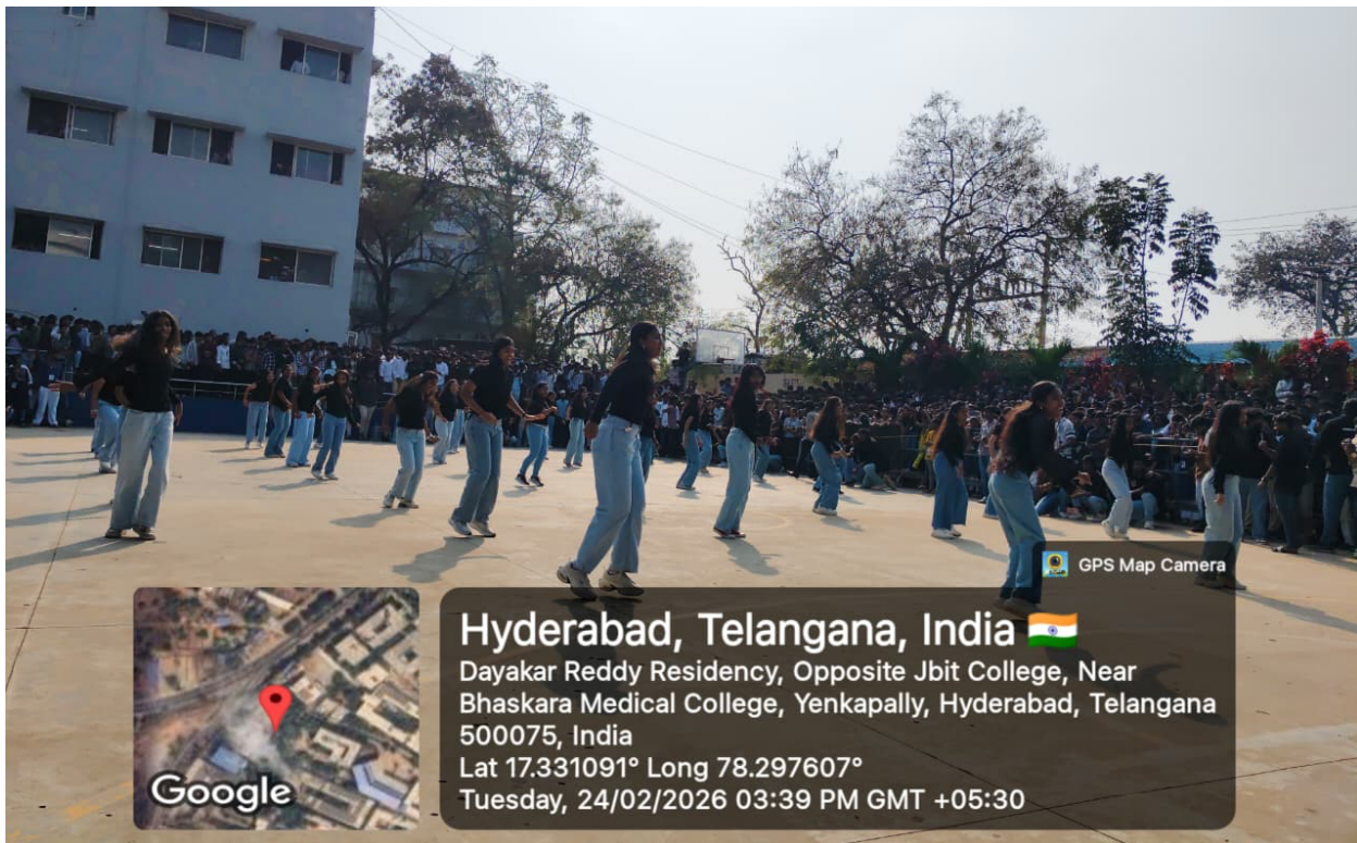
Fig. 3: Girls Student Activity Centre members performing an energetic dance sequence during FLASHMOB 2026.