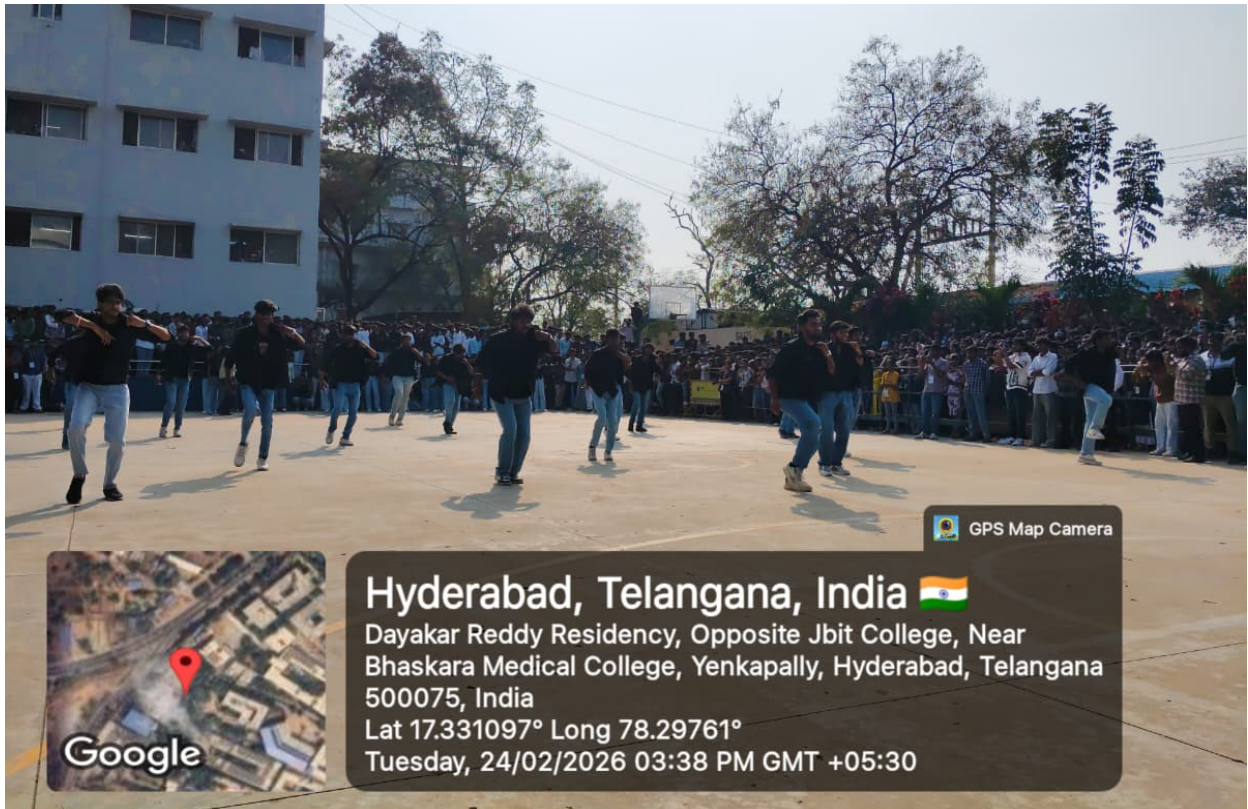
Fig. 2: Boys Student Activity Centre members performing dance to various songs during FLASHMOB 2026.