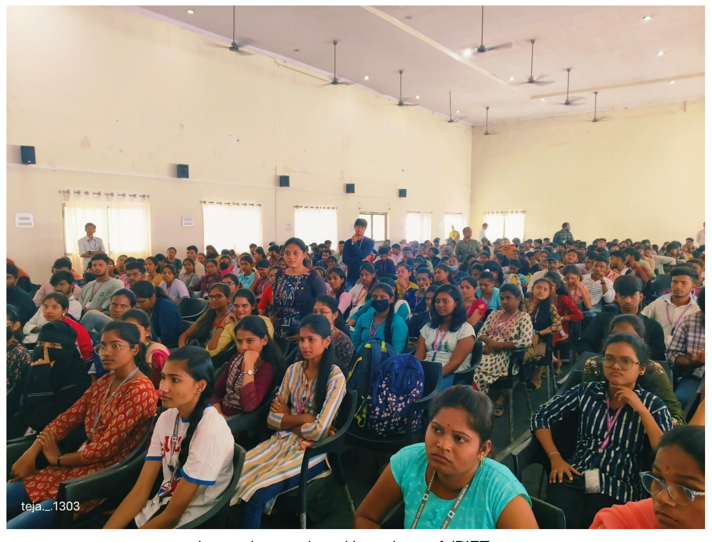
Interactive session with students of JBIET