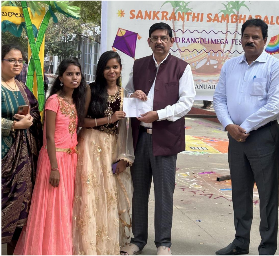
Prize Distribution for Rangoli competition