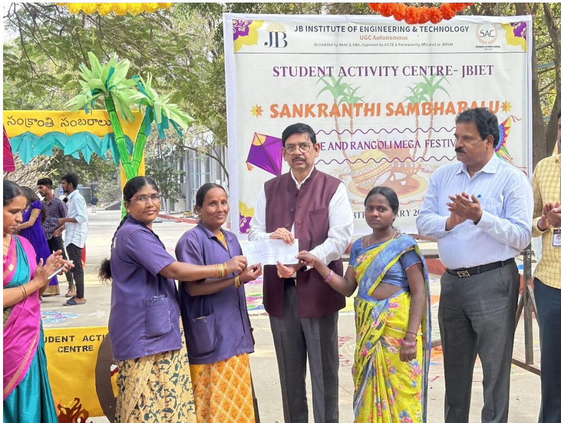
Prize Distribution for Rangoli competition