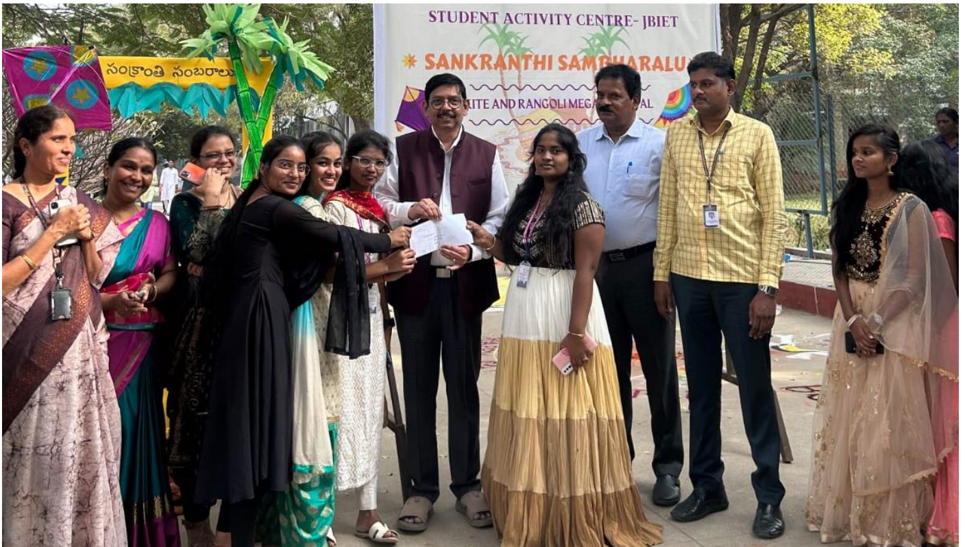
Prize Distribution for Rangoli competition