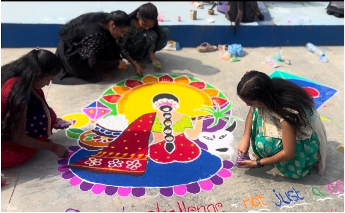
Rangoli competition in the Basketball court