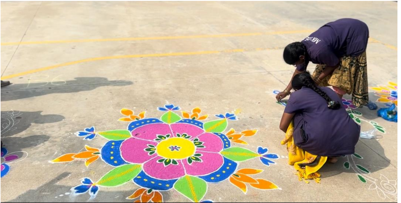
Rangoli competition for the non teaching staff