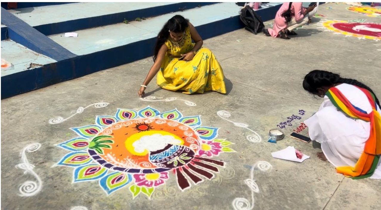
Rangoli competition in the MNR Open Air auditorium