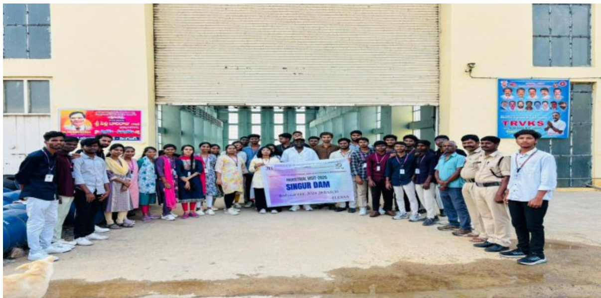
Fig.3: faculty and Students along with DRDL Staff