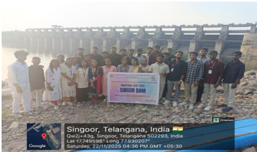
Fig.2: Faculty and Students at the Singur Plant