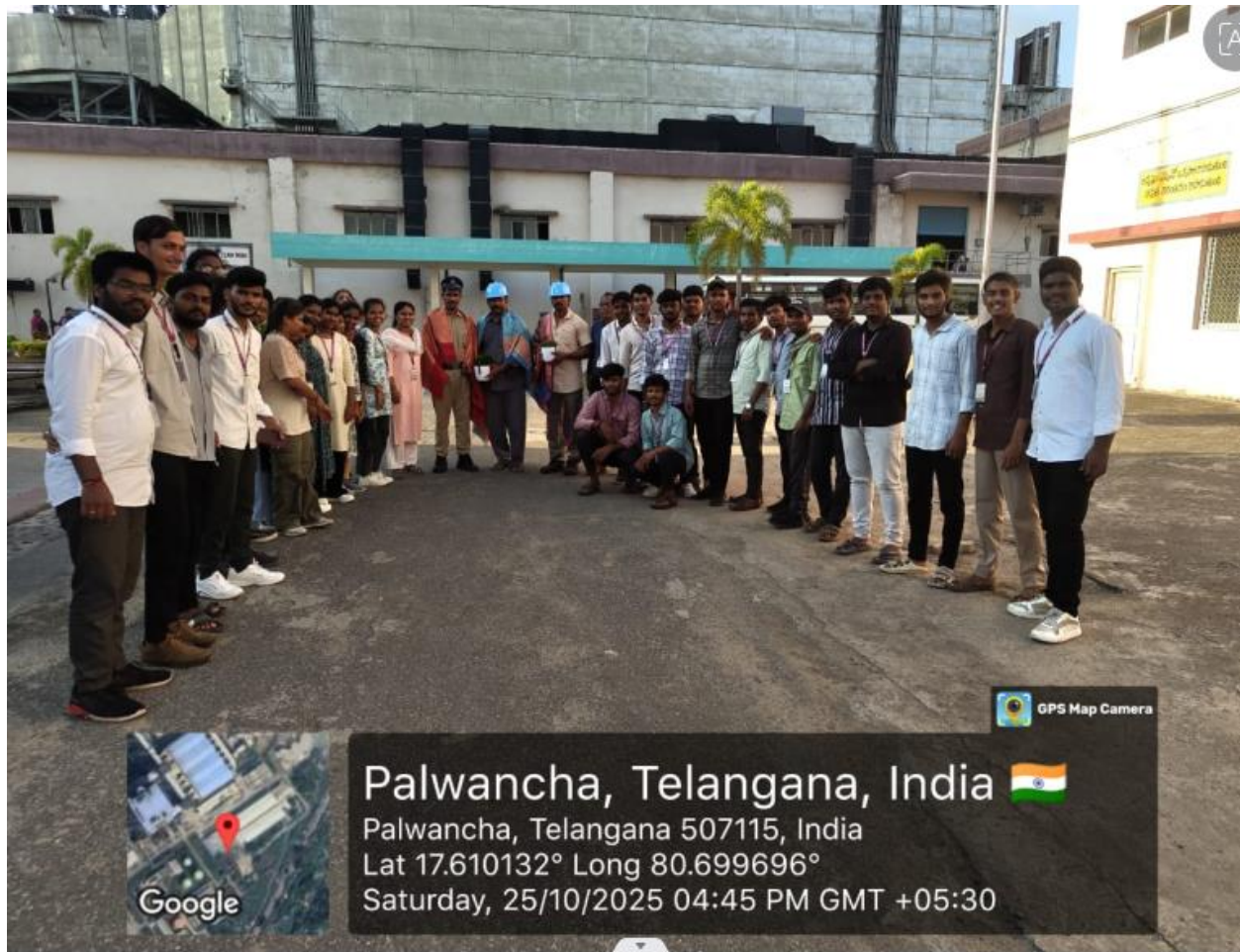
Felicitaton to the staff of KTPS ,Palwancha along with the III yr EEE students and Faculty