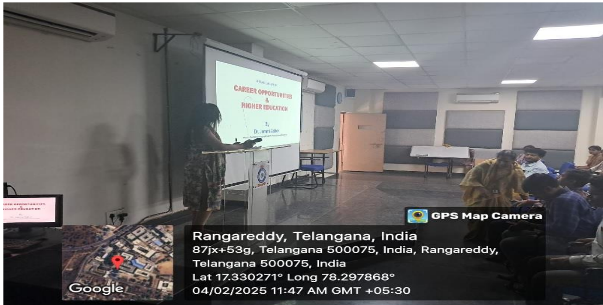
Introducing about Programme and Inviting Speaker